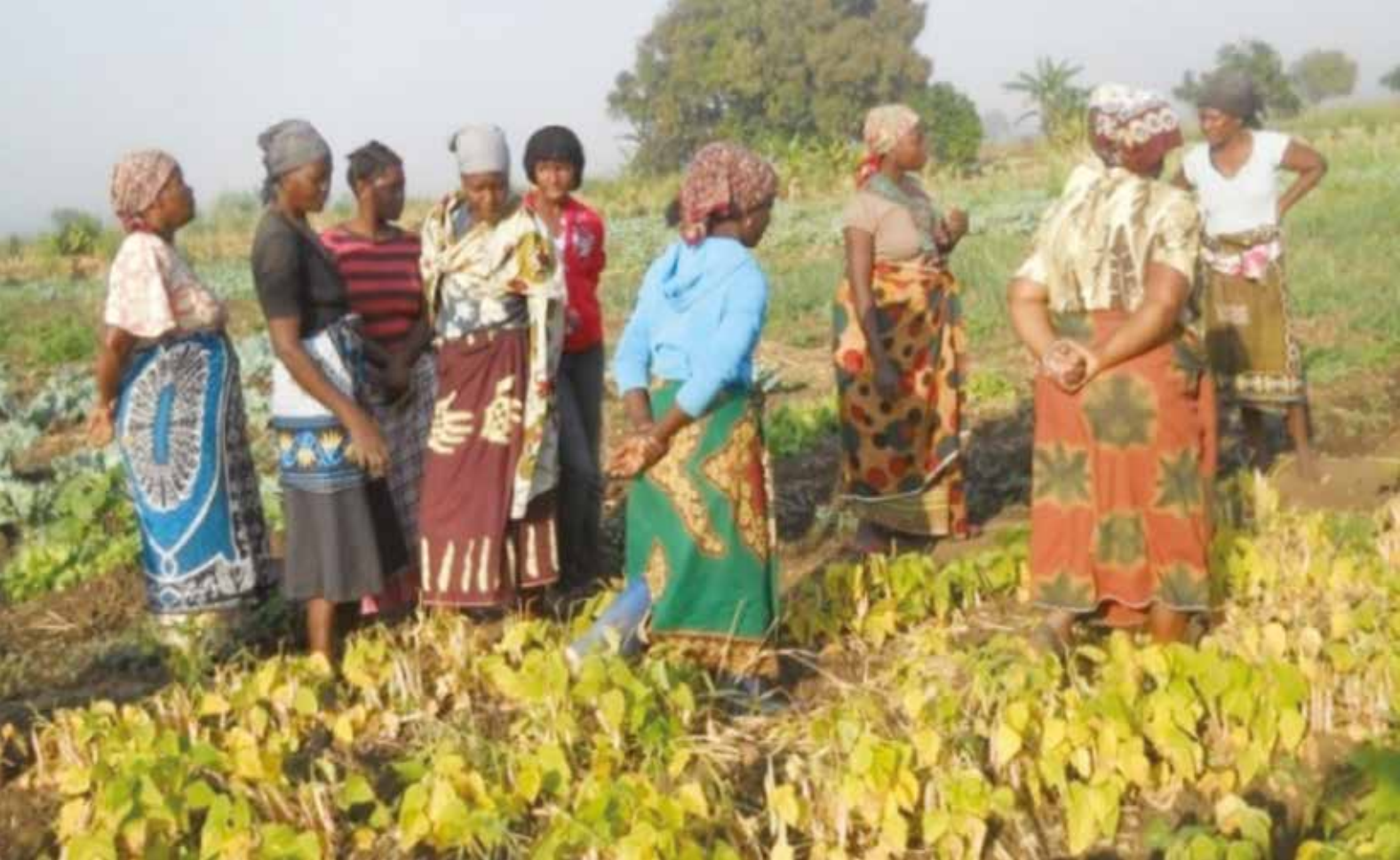
Field day and evaluation of P-efficient genotypes

maize was reduced by 22.5% when grown with the P-efficient lines, compared to the yield obtained when grown on its own. By contrast, the maize yield was not reduced when grown with the deep-rooted bean types. The researchers concluded that competition between bean and maize roots was greatest with P-efficient lines as they explored a similar layer of the soil profile. The choice of bean plant type to grown in polyculture will depend on a range of factors including the priority farmers attach to each of the crops and, if the harvested seed is to be sold in the market, the relative price they expect to obtain.