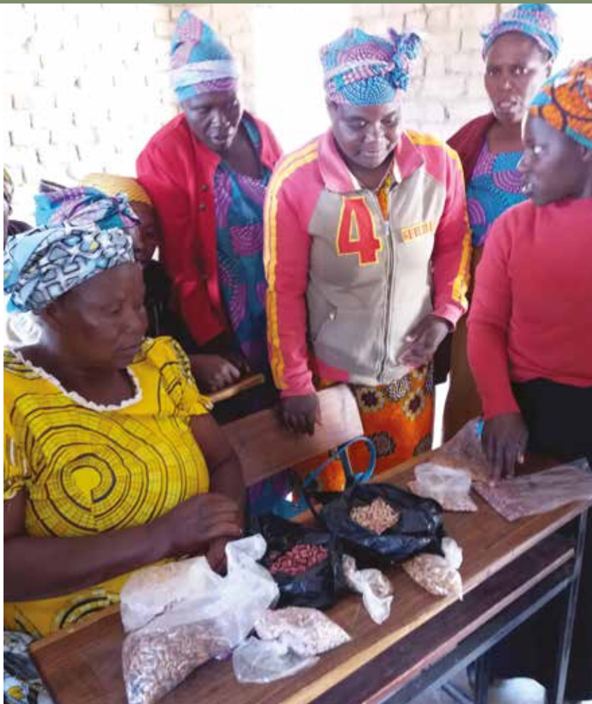
Women in Rotanda select their preferred P-efficient bean lines

An example of the varietal evaluation process with farmers is seen in Nhatepe village in Angonia district in the 2014 cropping season. Farmers there received approximately 200 to 250 gm of seed of six P-efficient bean lines. At the end of the season, farmers compared the performance of the lines. They observed that all of the lines are early maturing and have a determinate growing habit, with more uniform grain size and higher yield than the local varieties they had been growing previously. They selected three lines based on yield, marketability, and taste. Both women and men preferred a black colored bean variety called Ica Pijão for household consumption, while men also preferred Catarina and LPA 28 for sale in the market. By contrast, in another village in Sussundenga district, Rotanda, farmers selected only lines which had both high yield and were accepted by traders. Interestingly, Ica Pijão was not selected in Rotanda in spite of its high yield. The reasons for this are not well understood but are currently being explored.